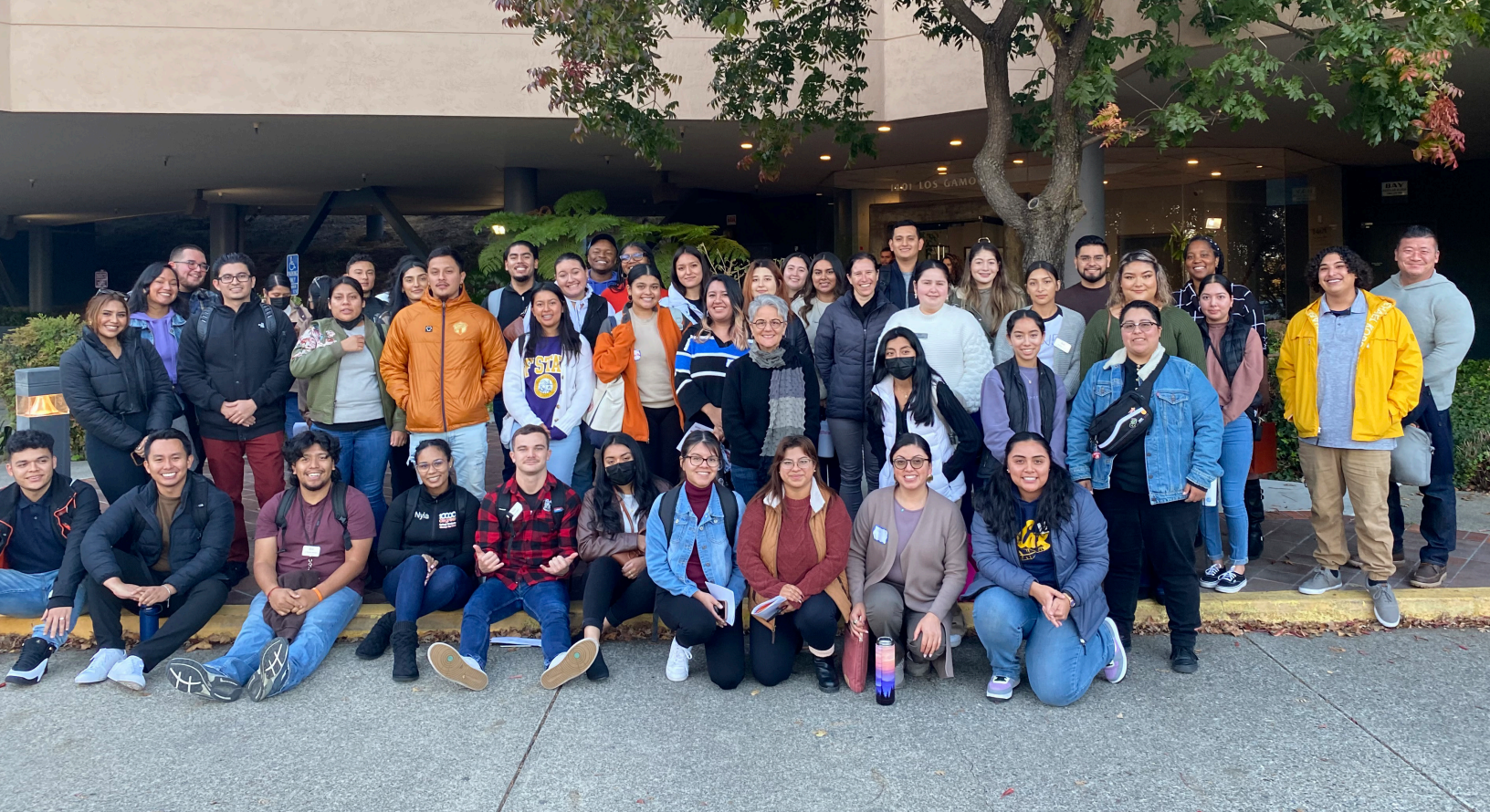
10,000 Degrees Staff & Fellows at 2022 Program Palooza