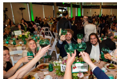
Staff from Keysight Technologies toasting