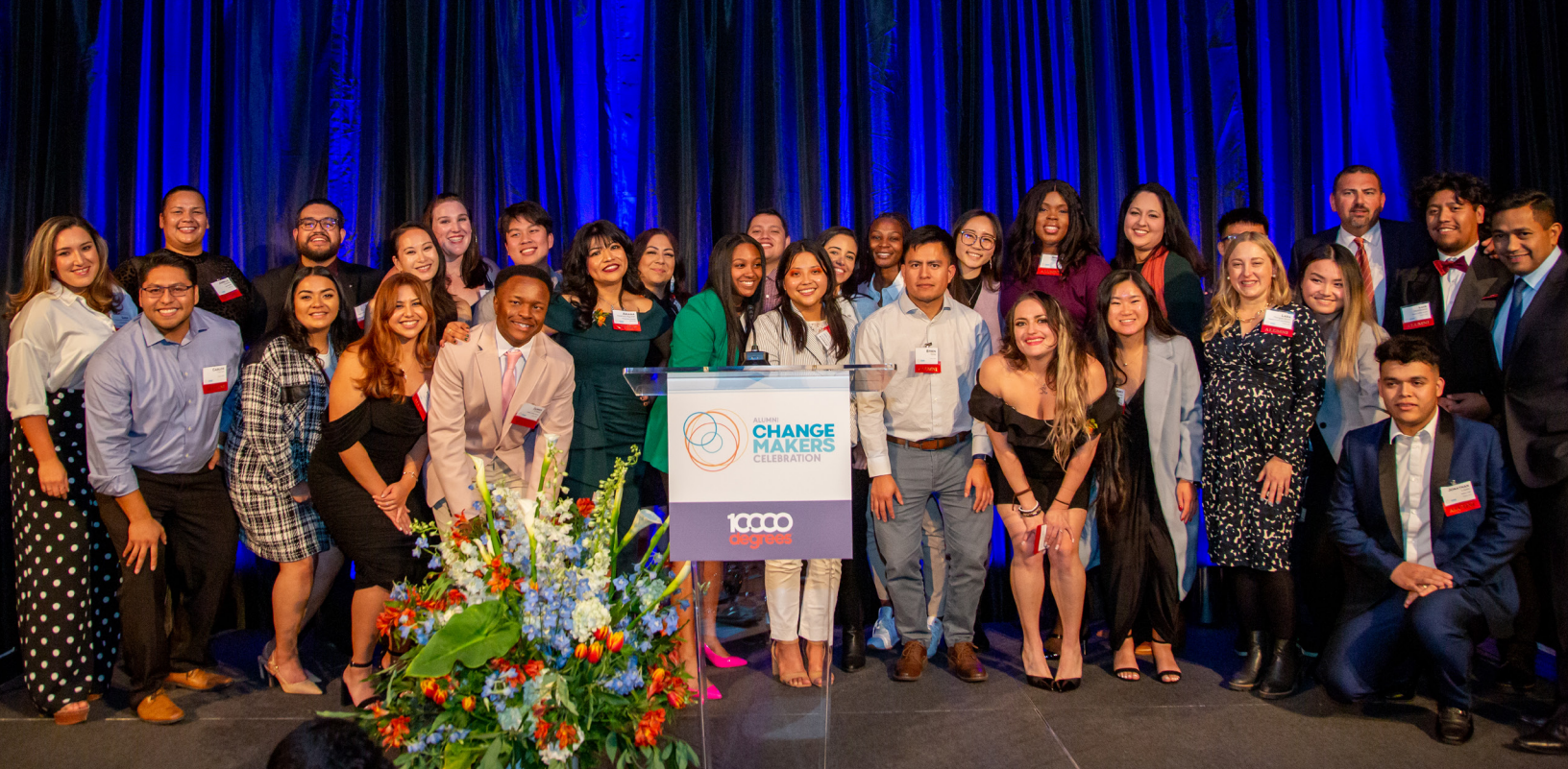
10,000 Degrees Alumni at 2022 Alumni Changemakers Celebration.