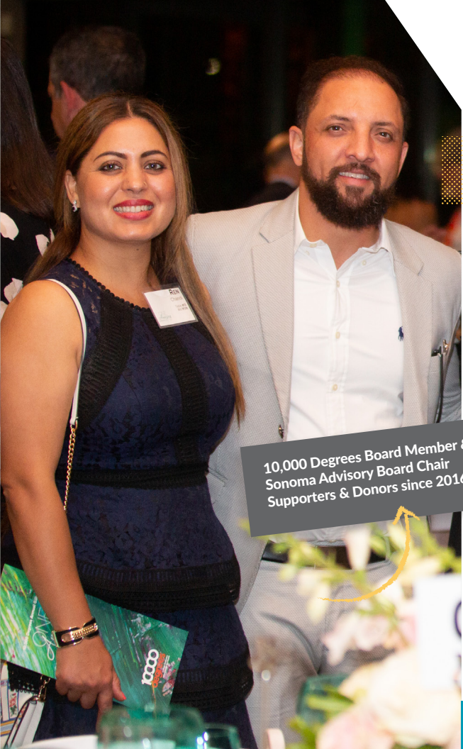
10,000 Degrees Board Member & Sonoma Advisory Board Chair Supporters & Donors since 2016