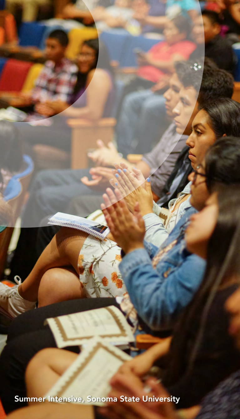
Summer Intensive, Sonoma State University