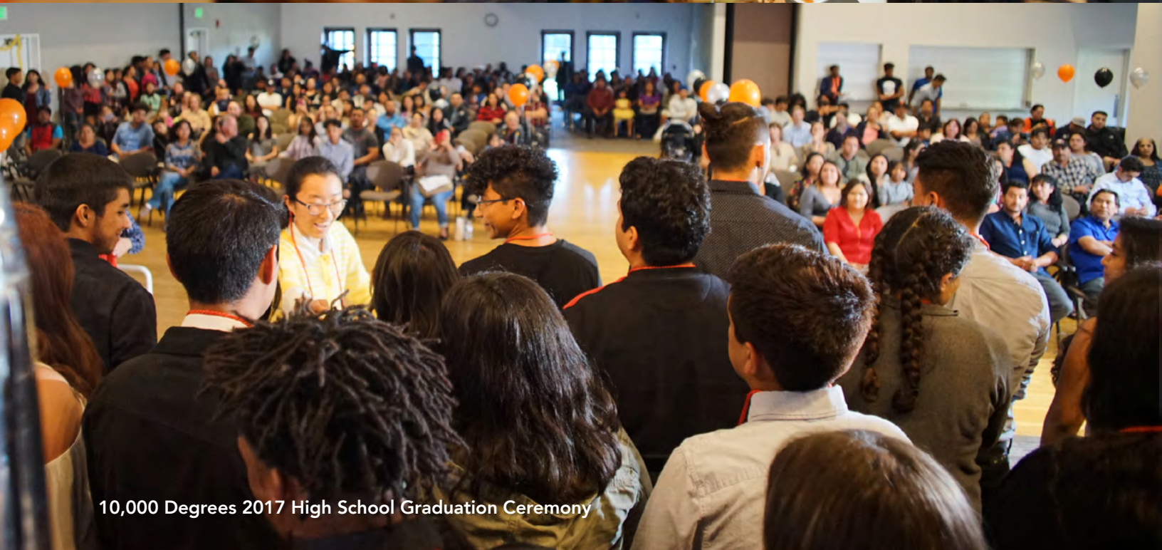
10,000 Degrees 2017 High School Graduation Ceremony