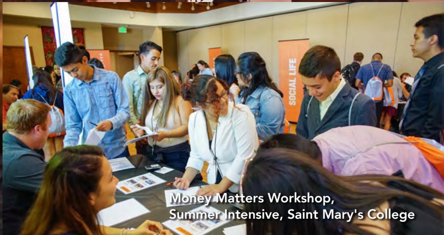
Money Matters Workshop, Summer Intensive, Saint Mary's College