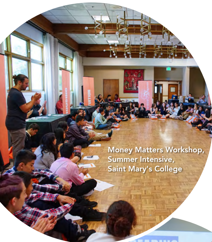
Money Matters Workshop, Summer Intensive, Saint Mary's College