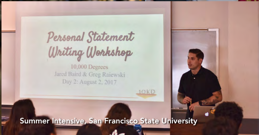
Summer Intensive, San Francisco State University